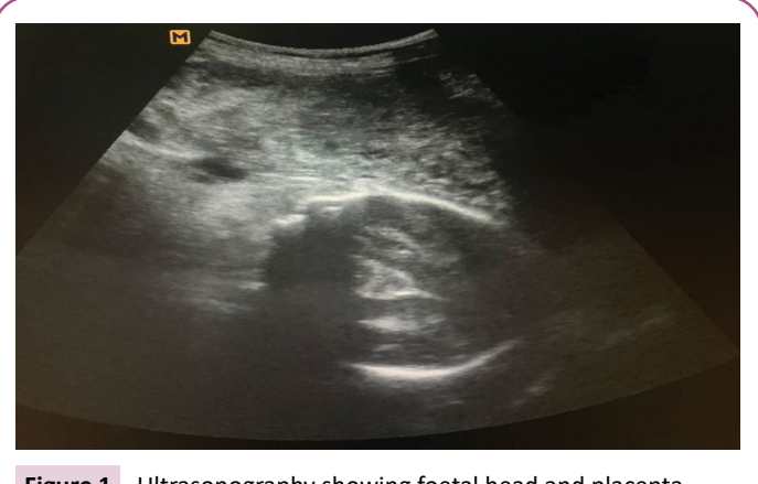
Figure 1 Ultrasonography showing foetal head and placenta.