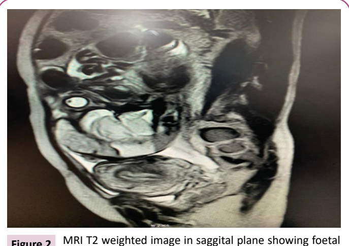
Figure 2 MRI T2 weighted image in saggital plane showing foetal head lying superior to uterus and empty endometrial cavity.