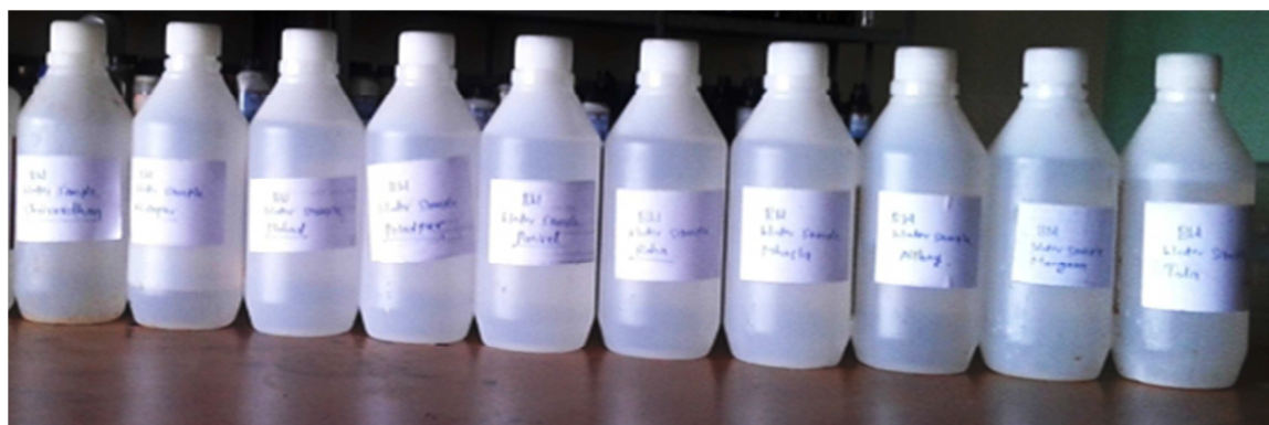
Figure 1 Collection of Sample from the various Areas

Ten drinking water samples were taken from ten Bore wells. Good quality half litre polythene bottles were used for sample collection. Samples were collected directly in the rinsed bottles without using any preservatives, from hand tube wells, bore well. After the water samples were transported to the laboratory, fluoride analyses were performed immediately. These analyses were done in the months from August- September 2014 as shown in Figure 1.