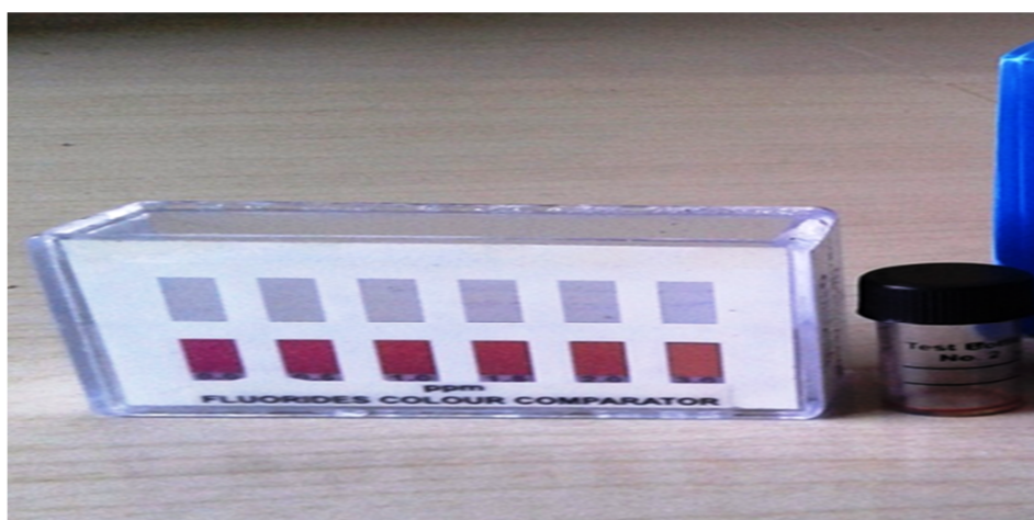
Figure 2 Determination of fluoride in water by using kit

Matching the colour For matching the colour of test water with the colours on the Comparator, place the test bottle (3 ml) contain water sample with Fluoride test reagent in comparator. Hold the comparator against light, placing it between source of daylight and the observer, at his eye level. Match the colour of test water with colour on