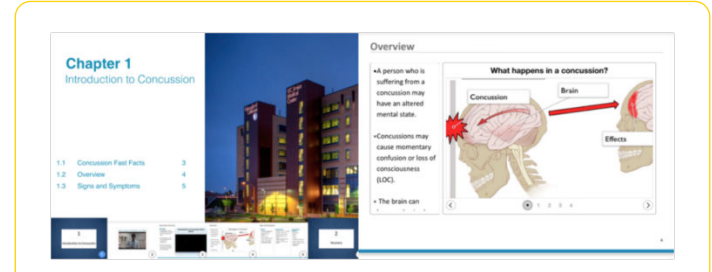
Figure 2: Screenshots of the Concussion iBook depicting integration of video content, pop-up and scrolling widgets, as well as interactive image galleries.

surgical interventions, and digital artwork explaining numerous neurosurgical pathologies.