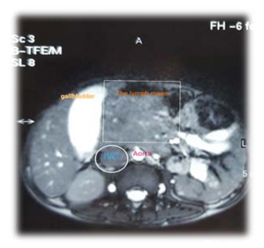
Figure 2. MRI of the abdomen shows a large lymph mass extending to liver hilum and pancreatic head.