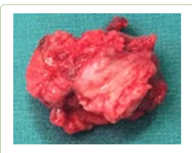
Figure 3 Excised endometriotic mass.