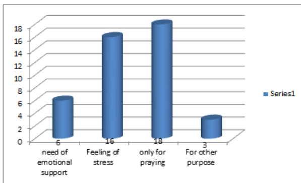
Bar graph that shows number of students goes to religious places

In this study 11(25.58%) go to religious places like church and mosque only for praying, 12(27.9%) go to church /mosque when they feel stress in order to alleviate their stressful situations, and 3(6.98%) of respondents go to religious place when they need emotional support and the rest 2(4.65%) of the respondent go to religious places for other purposes. From this we can understand that religion play great role in coping different stress full problems. For further information show below in the bar graph.