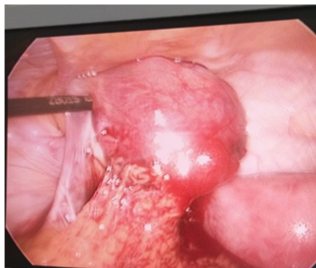
Figure 2 Intraoperative image showing the uterus with a ruptured right interstitial pregnancy.

She was discharged on the second postoperative day and followed-up regularly at the obstetrics clinic with double iron. Her hemoglobin went back to normal values of 12.2 g/dl during the follow up period. The intraoperative specimen was followed up and confirmed a right ectopic pregnancy. Patient had later on multiple antenatal visits that were all reassuring. She underwent an Anatomy scan that was reassuring as well. She is doing well with her pregnancy up to the moment this report is being written.