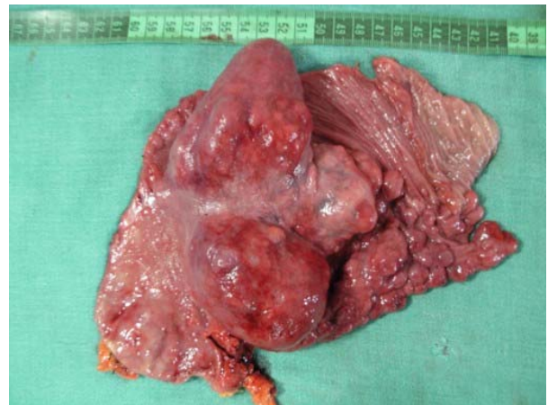
Figure 3. Gross specimen large and small multiple intraluminal polypoidal lobulated masses occupying the duodenum.

The most common location of these lesions is the posterior wall of the first and second parts of the duodenum. In a study of 27 patients, Levine et al. [15]