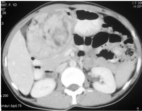
Figure 1. Axial CECT section shows a large heterogeneous mass lesion in relation to the antropyloric region of the stomach and the C loop of the duodenum. Fat plane with the head of the pancreas is preserved.

were separated from the uncinate process as is done in a standard pancreaticoduodenectomy. Cholecystectomy was performed in a retrograde fashion and a catheter was introduced through the cystic duct stump to identify the papilla. The dissection was continued in the interface between the pancreas and the duodenum by ligating and dividing all the vessels. Upon reaching the major papilla, the duodenum was made taut and the papilla was divided. During the course of the dissection, the minor papilla was ligated.