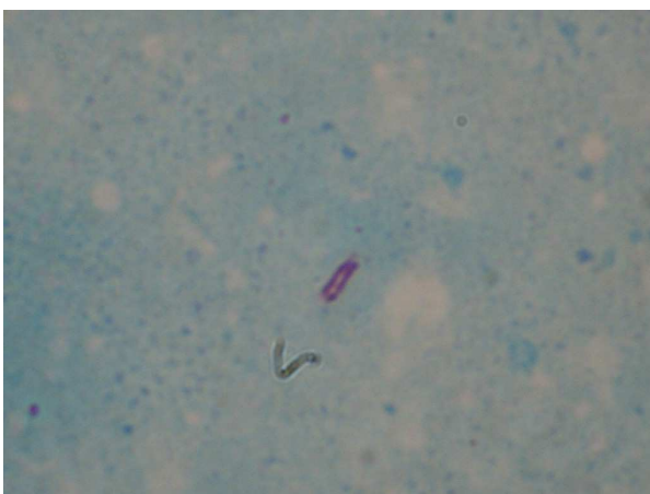
Figure 2. Ziehl-Neelsen stain showing acid fast bacilli (Case #1).

A 15-year-old woman presented with complaints of continuous upper abdominal pain for the past 25 days with occasional radiation to the back. The pain was severe in nature and she had to take analgesics regularly. The pain was unrelated to meals. Other