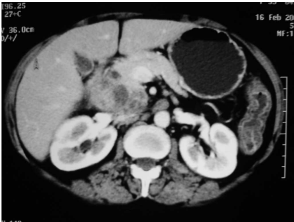
Figure 1. CECT abdomen showing a mass in the head of the pancreas with necrosis (Case #1).

(reference range: 4,000-11,000 mL -1 ) with a normal differential count, erythrocyte sedimentation rate of 60 mm/first hour (reference range: 0-17 mm/first hour). Liver function tests were normal. Results of HIV serology were negative, and results of chest radiograph were normal. A CECT abdomen (Figure 1) showed a mass in the head of the pancreas with multiple conglomerate peripancreatic lymph nodes and was associated with central necrosis. Portal vein was encased by the mass. Based on CT scan, the mass was non resectable and we advised CT guided FNA from the mass for consideration of chemoradiotherapy. FNA (using 22 G needle) from the peripancreatic lymph nodes showed epithelioid cell granuloma and caseation necrosis. Ziehl-Neelsen stain revealed acid fast bacillus (Figure 2). The patient received antituberculous therapy for 6 months. The patient was well at the 48-month follow-up.