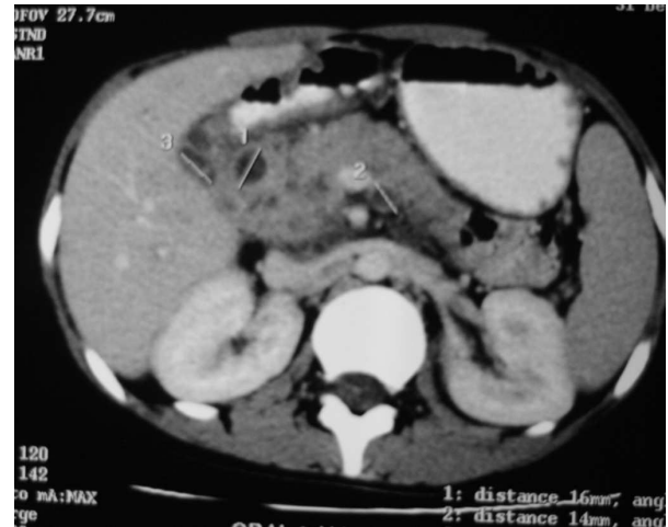
Figure 3. CECT abdomen showing pancreatic head mass with necrotic peripancreatic lymph nodes (Case #2).

symptoms were anorexia, 7.3 kg weight loss, and low-grade fever at night. The patient did not have jaundice or gastrointestinal bleeding. There was no past history of tuberculosis of the patient or her close relatives. Physical examination revealed pallor and a fixed, mildly tender, irregular surfaced mass at the epigastric region. Investigations showed hemoglobin of 7.3 g/dL (reference range: 13.2-16.2 g/dL), total leukocyte count of 8,600 mL -1 (reference range: 4,000-11,000 mL -1 ) with a normal differential count, erythrocyte sedimentation rate of 102 mm/first hour (reference range: 0-17mm/first hour). Liver function tests were normal. Results of HIV serology were negative, and results of chest radiograph were normal. A CECT abdomen (Figure 3) showed heterogeneously enhanced pancreatic head mass with multiple enlarged peripancreatic lymph nodes with central necrosis. EUS-guided FNA (using Echotip 22G, Wilson Cook needle, Salem, NY, USA) from the peripancreatic lymph nodes showed epithelioid cell granuloma and caseation necrosis (Figure 4) but Ziehl-Neelsen stain failed to reveal any acid fast bacillus. We started antituberculous drugs and the patient improved